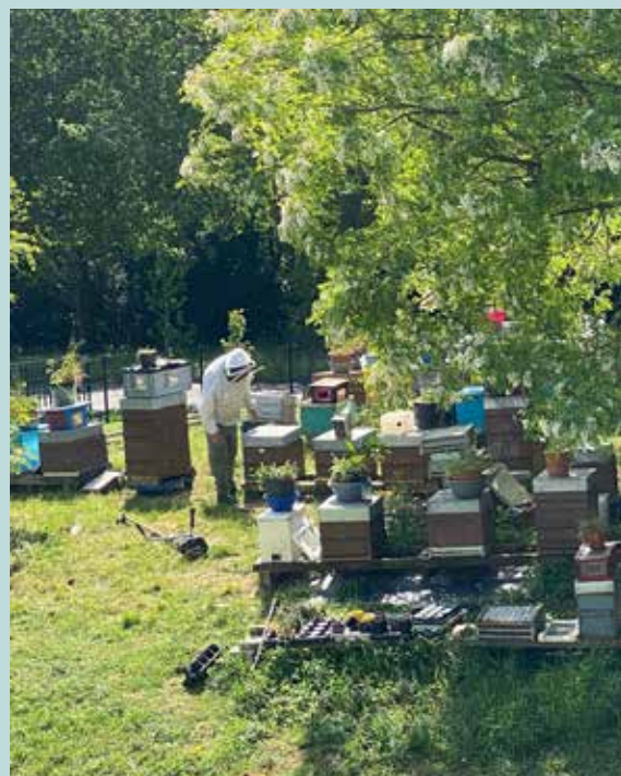
The school hives