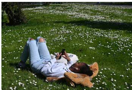
Educational resource center