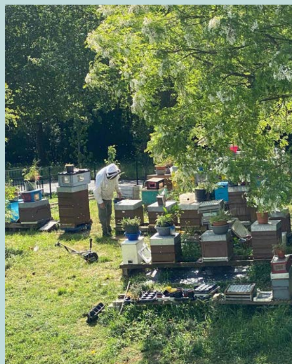
The school hives